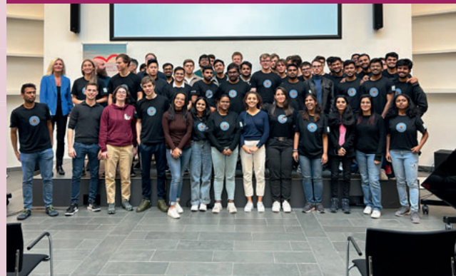
Many creative minds coded at the Digital Twin Hackathon at Fraunhofer IESE.

The Digital Patient Twin can map physiological processes in the human body.